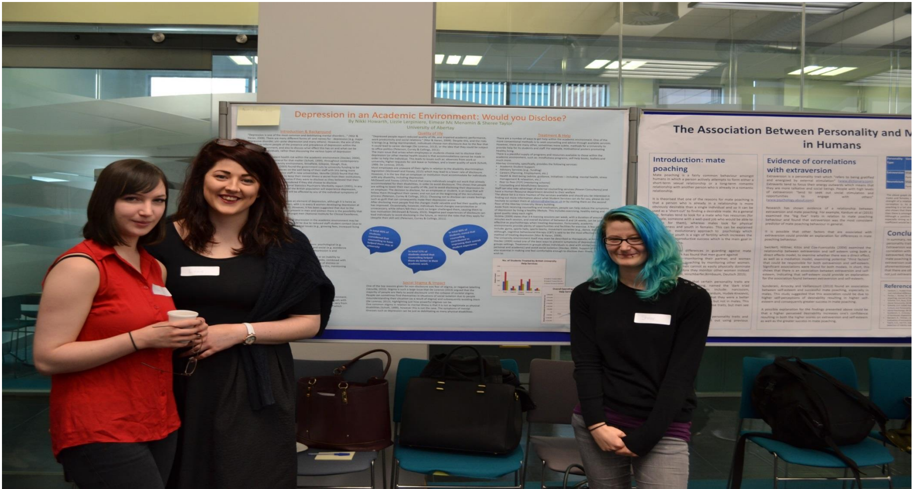
Poster on depression in academic life