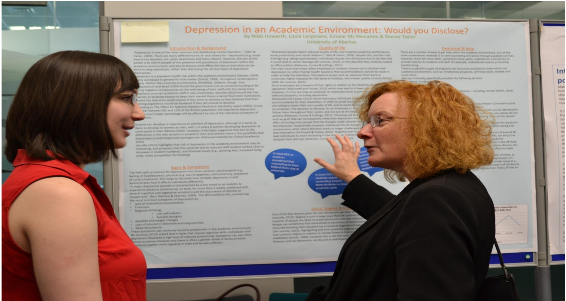
Student discusses disclosure of mental illness in the workplace with our University Secretary